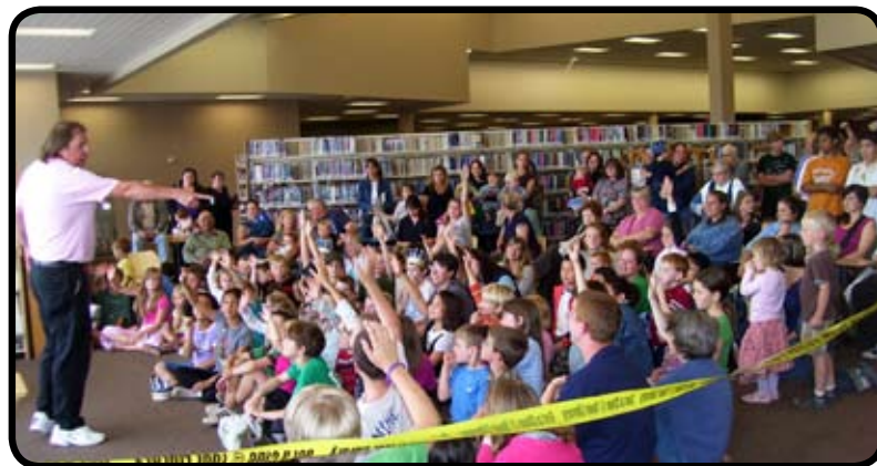
The opening day celebration included a magic show.

For more details on the project and photos of the new building, go to: www.anchoragelibraryfoundation.org/projects.html .