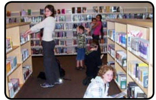
The new Chugiak-Eagle River Branch offers increased learning opportunities for youth.