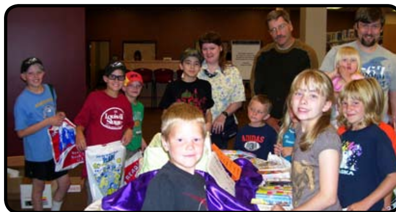
The new children’s area is a hit with local kids.