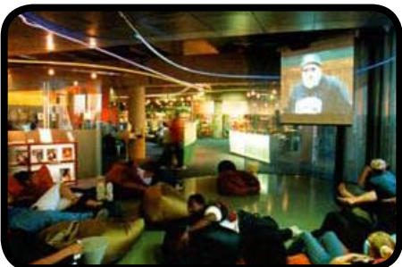
Teens hanging out in the Teen Zone at the Farmington Public Library in New Mexico.