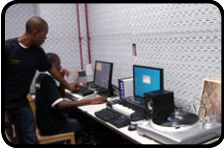
Mixing it up in the sound lab at the YOUmedia teen center at the Harold Washington Library in Chicago.