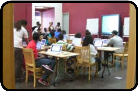
Teens participate in group instruction at the YOUmedia teen center at the Harold Washington Library in Chicago.