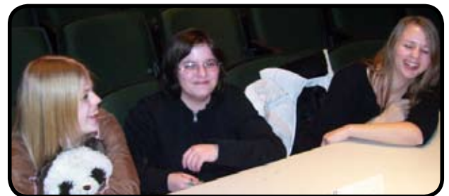
Teens share a laugh at a trivia night at Loussac Library.

The creation of a teen space at Loussac Library is a major goal of the Anchorage Library Renewal Initiative and the Library Community Plan, which have both received wide community input and support. The project cost is under $70,000. Lead supporters include the Anchorage Rotary Club and the Rasmuson Foundation. The project will launch in Fall 2010 and be completed by June 2011. Monetary, in-kind and volunteer donations are needed to successfully create the teen space.