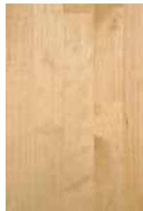
WOOD TONES USED