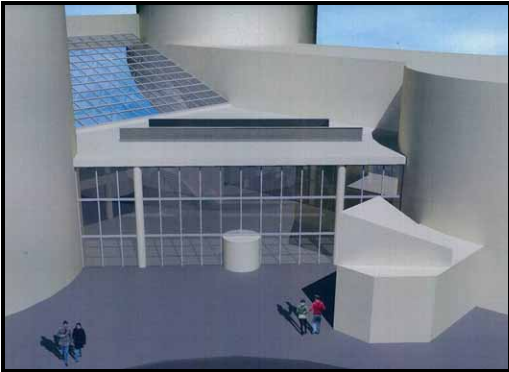
Proposed entrance to Z.J. Loussac Library from ground level. Designed by USKH.