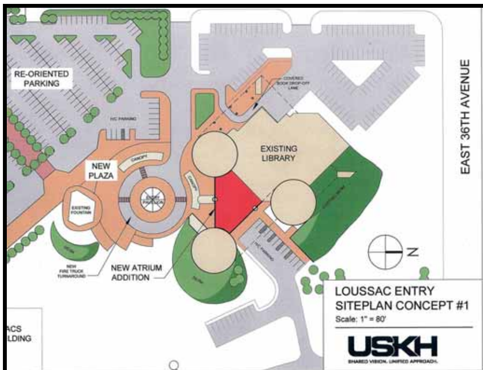
Proposed site plan for renovation of Z.J. Loussac Public Library. Designed by USKH.