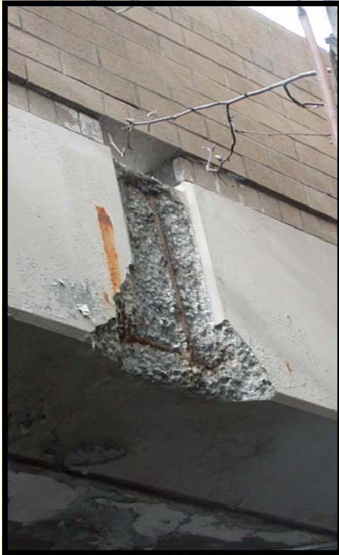
Terrace entrance to Z.J. Loussac Library. Major structural damages will be repaired with money from the 2008 municipal bond.