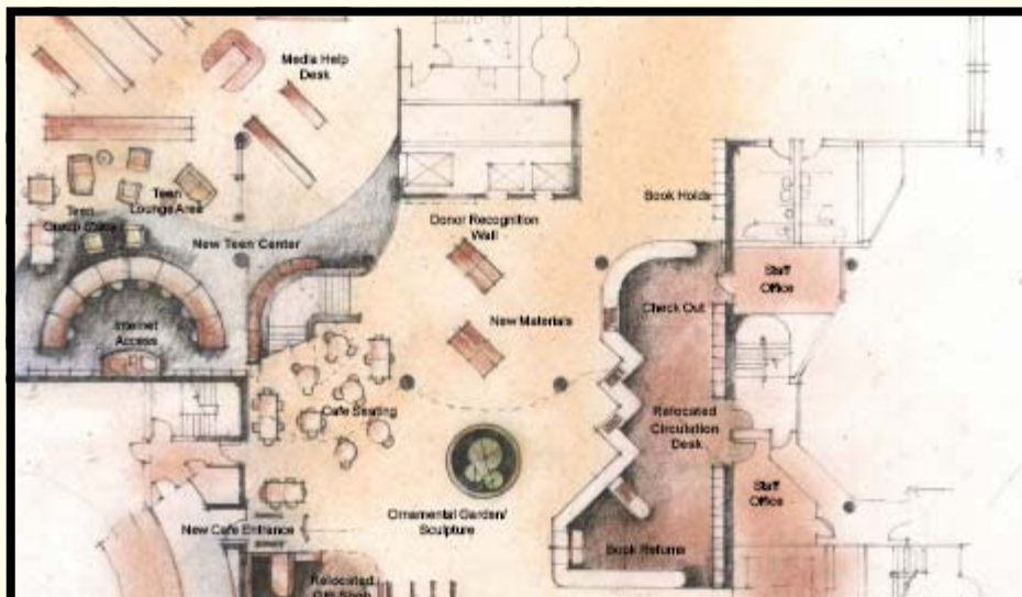
Proposed plans for Loussac entrance.