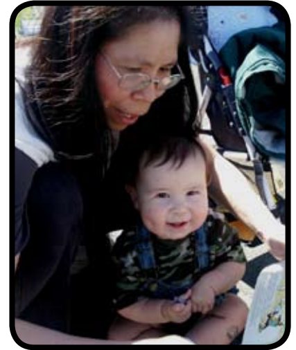
The new library will offer increased learning opportunities for children

As a local leader in sustainability, the Mountain View Branch will showcase the many economic, health and environmental benefits of green building design and will serve as an example for future projects across the city. The new library will also help build community and foster the arts as a centerpiece of the Mountain View Arts and Cultural District.