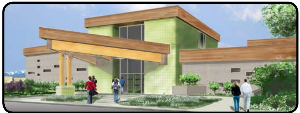
Proposed redesign of the Mountain View Library and Community Room.