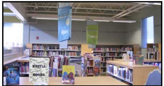
The new Mountain View Branch Library opened September 7th (top). Sisters check out the latest books at Mountain View (middle). The Children's Learning Center was made possible by a donation from the Gottstein Family and features bright colors and many languages (bottom).