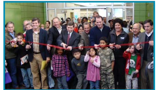
continued on page 2, A Great Library

The Mayor's proposed budget ignores the wishes of our community as expressed in the recommendations from the 2010 community budget dialogue, in which the majority spoke out in favor of maintaining current service levels and sparing departments with small budgets from further cuts. While the Municipal budget has nearly doubled over the past ten years, the Library's portion has decreased from a high of 4% of the MOA budget in 1985 to today's low of 1.75%. Our library's ability to deliver the services that library users from preschoolers to retirees are demanding of it,